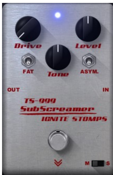
Fig. 2 – TS-999 Front Panel