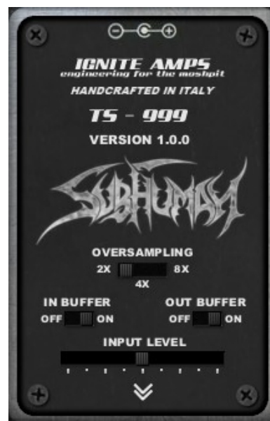
Fig. 3 – TS-999 Rear Panel